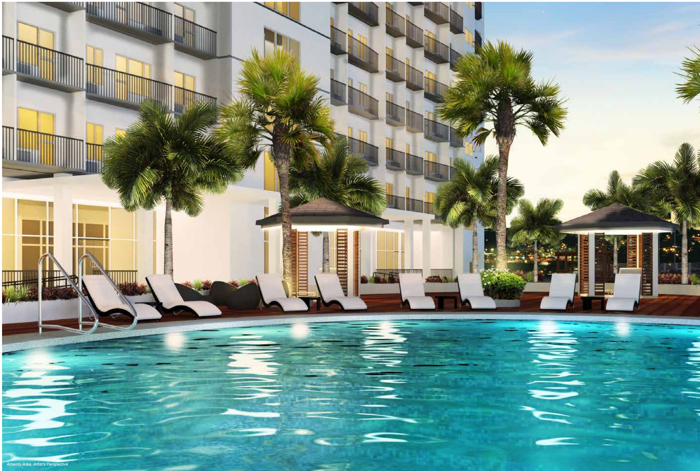
Amenity Area, Artist's Perspective