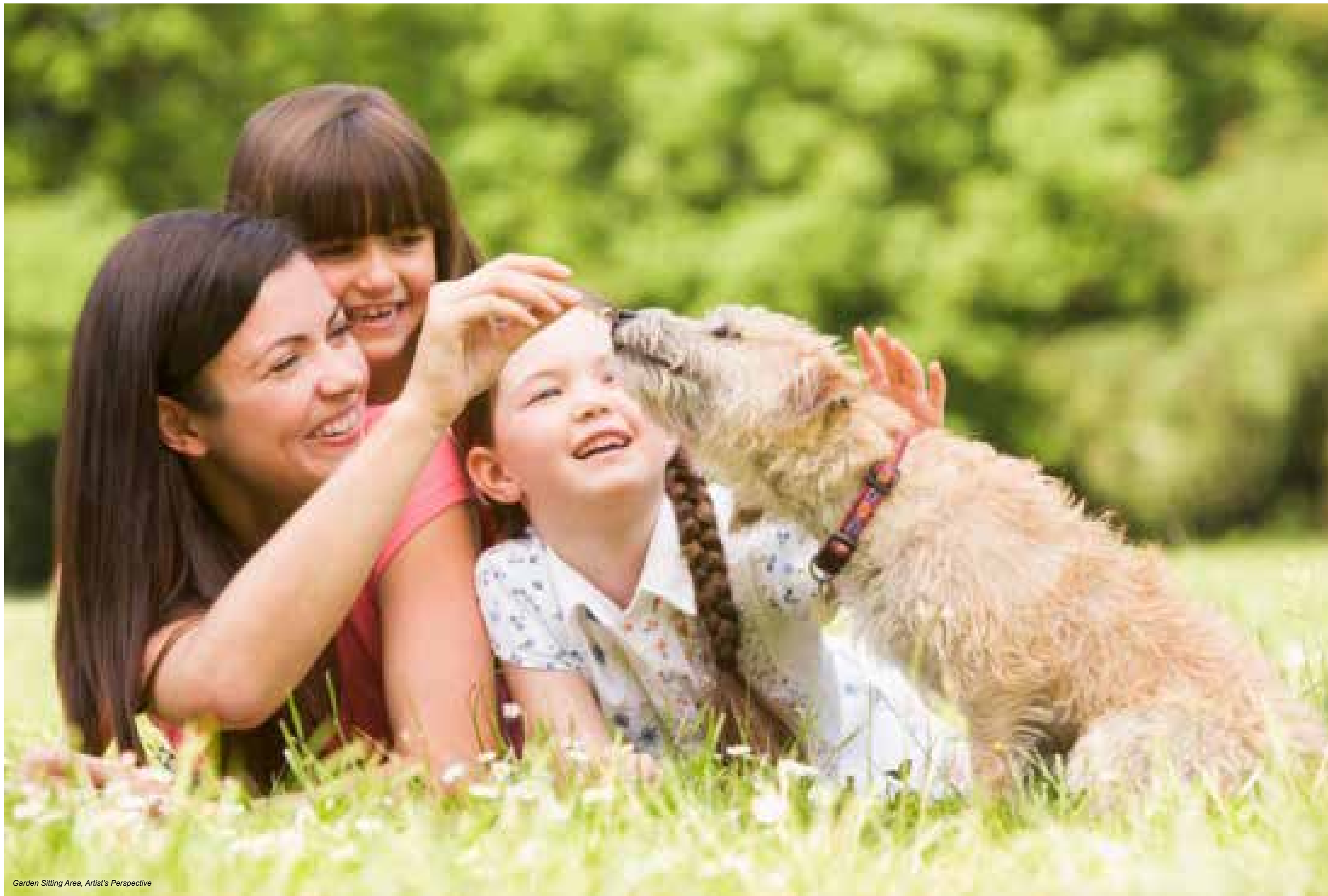
Garden Sitting Area, Artist's Perspective